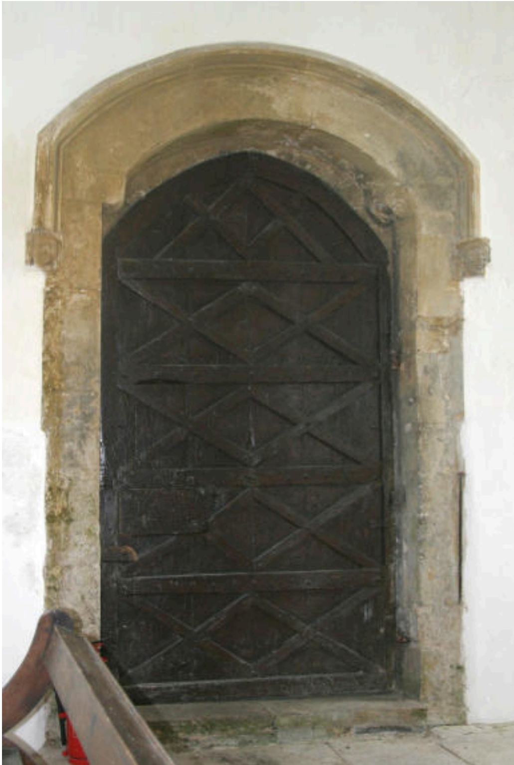
South Porch door. 15 th century. The porch contains some old graffiti.