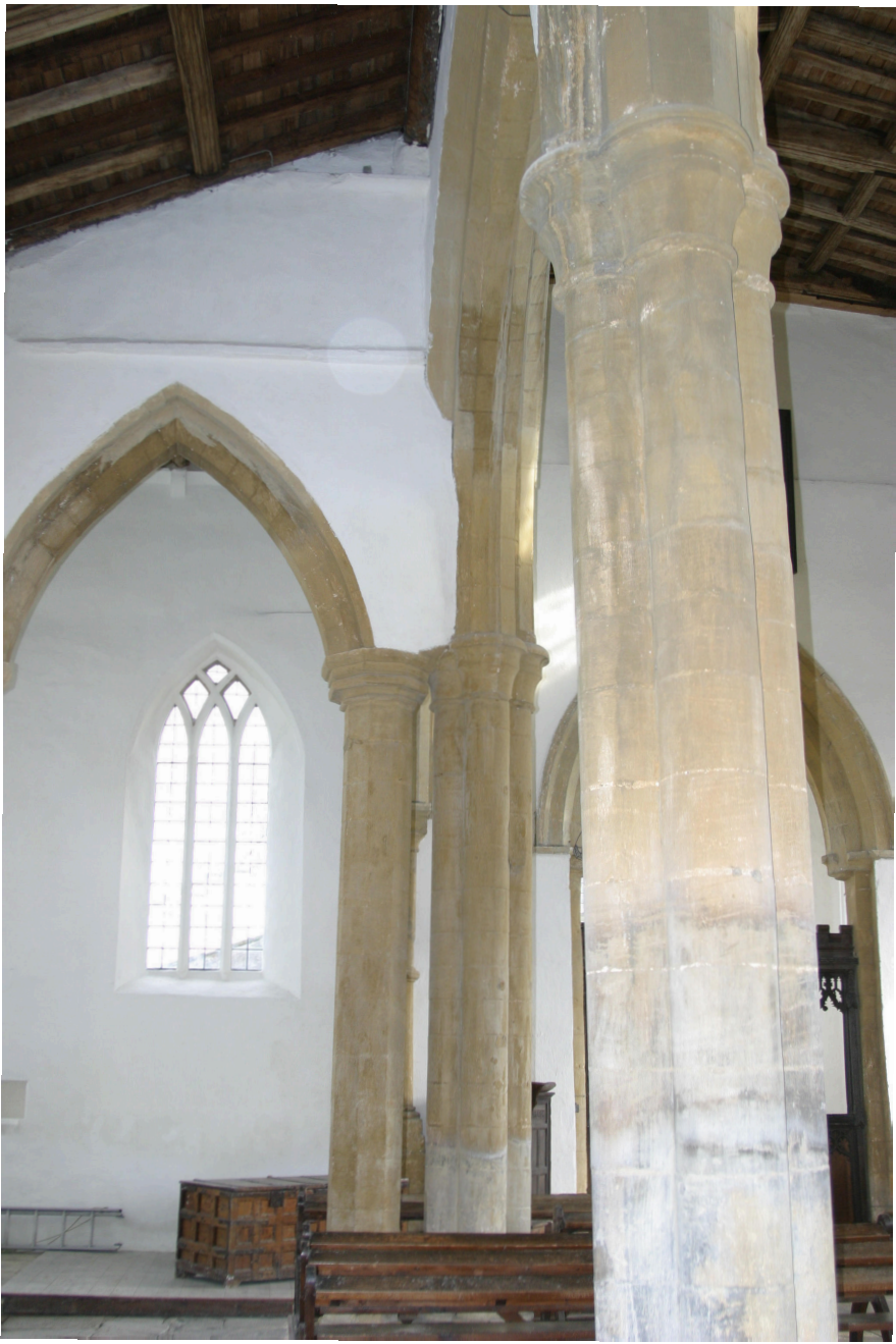
Octagonal Pillars in the aisles