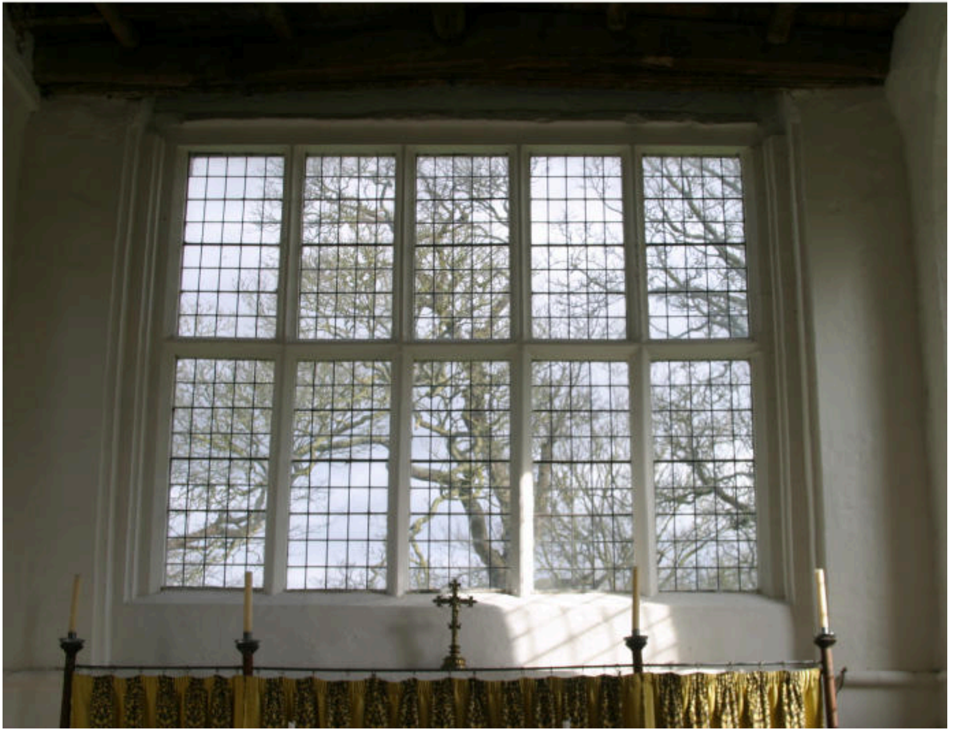
The East Window.