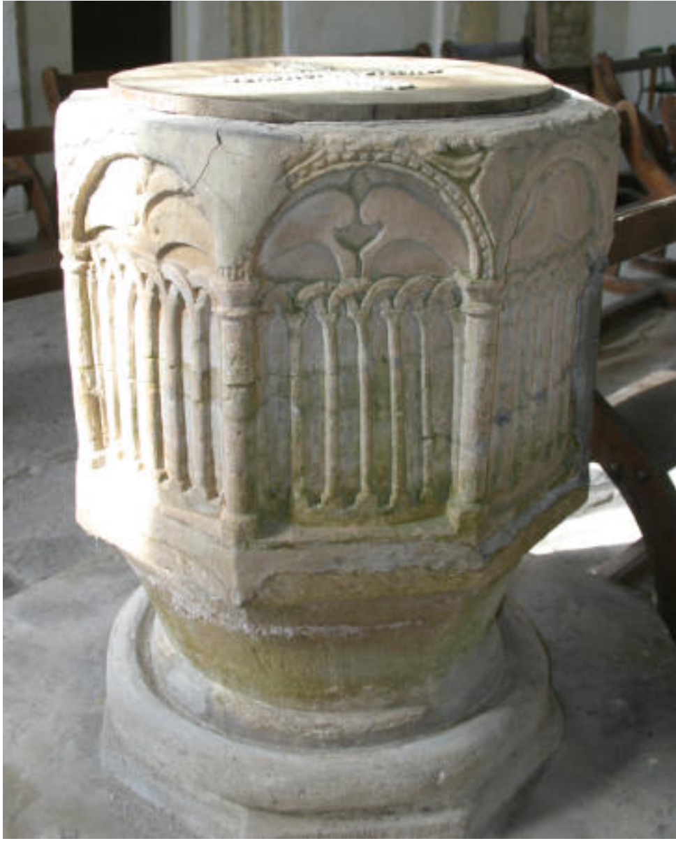
13 th century octagonal font with interlaced designs.